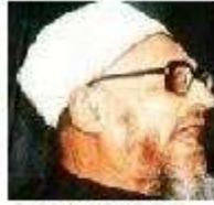
Shaikh Al Azhar

Spirituality Gateway in 131+ Languages www.Muhammad.com via Sheikhs of Azhar, all passed away remain Darwish standby in servitude